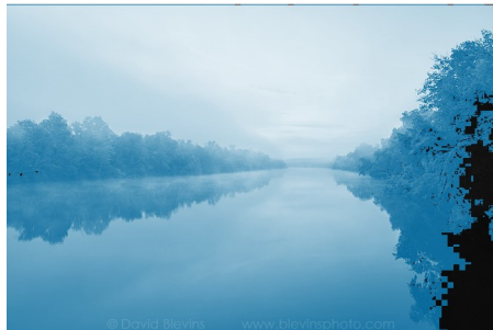
Overlooking the beautiful Cape Fear River

Catering services done by Howard's will provide all food with the exception of dessert. If other food is involved we will deliver only.